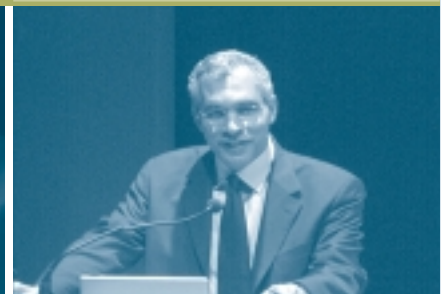
Steele answers questions from the audience following his lecture.